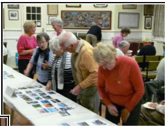
Judging in progress!