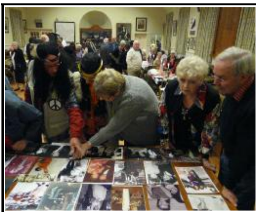
The Photo Table. What a difference 50 years have made!